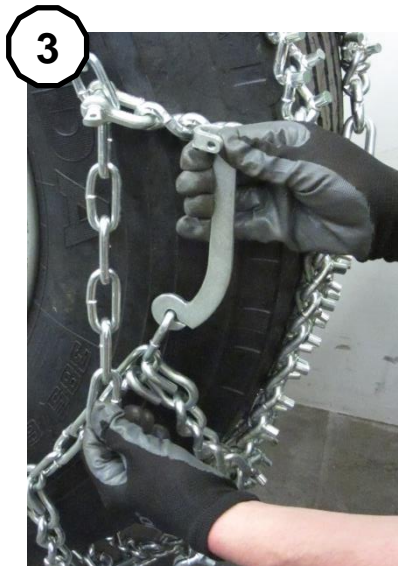
3 Take tension lever and pull it through a link in the side chain. If possible take back some links to get the chain tensioned well.