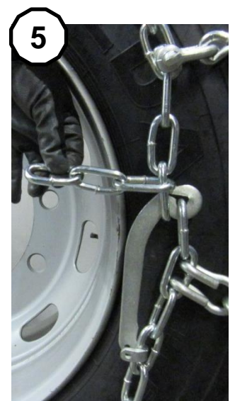
5 Secure end of tension lever in side chain

Repeat this procedure on inner tire side to tension and lock the inner side chain.