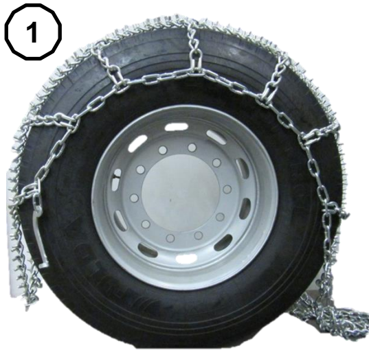
1 Place chain on the tire as shown with studs pointing away from tread.